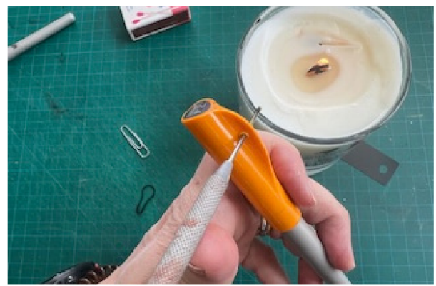
#2 Briefly pierce the widest part of the arched tab that protrudes from cylinder of the pen cap.