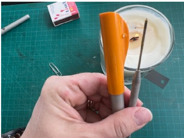
#3 The needle passes through like butter!