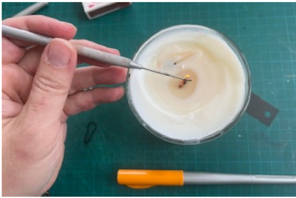
#1 Briefly heat your needle in the flame of the candle.